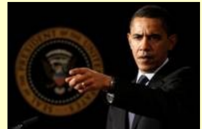
You, over there, sign my birthday card, OR ELSE I’LL ASK FOR ANOTHER RAISE IN THE DEBT CEILING AND TAX ALL YOU RICHIES OUT THERE!!”

I hope you got a little “kick” out of the quiz on page 8; the answer to all questions is obviously Obama; seriously it is sad that so many people consider POTUS such a great speaker but yet there are so many examples of the “lack thereof”.