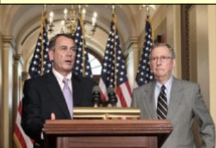
“Yes folks, we had to do this to prevent Harry from self-combustion –not pretty..”