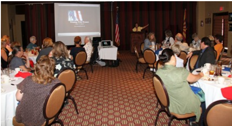
Attendees at the General Membership Meeting