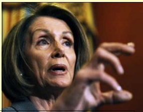
“I’ll get you my pretty..AND YOUR LITTLE SPENDING CUT TOO!!”

It was encouraging to see our Representative Gabby Giffords at the Capitol during the debt deal vote—it is truly remarkable to see her progress. It is being suggested that she run again in 2012 and some even have called for her to run for the Senate, but I think time will have to tell on where she stands in her physical condition. While I know of several candidates who plan to run for CD7, I have not heard anything about CD8. In closing, please continue to have a